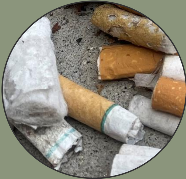
Butts and Filters