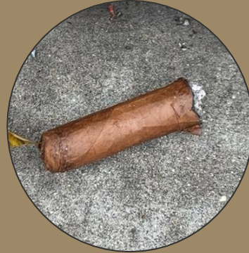
Other Tobacco Products